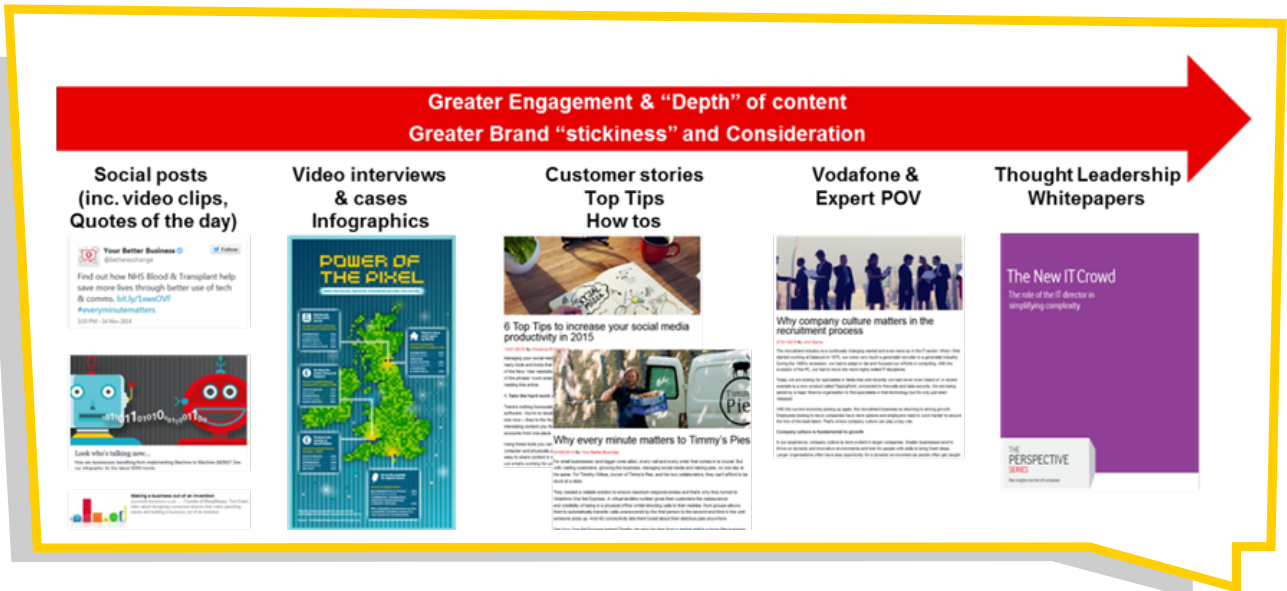
Fig2: Types of content served up by 'Your Better Business.'

As the platform's success has been recognised throughout the organisation, and backed up by interviews with business decision makers who confirmed the importance of relevant content to their views, the 'Your Better Business' platform and content has become a central cog for Vodafone's enterprise communications activity.