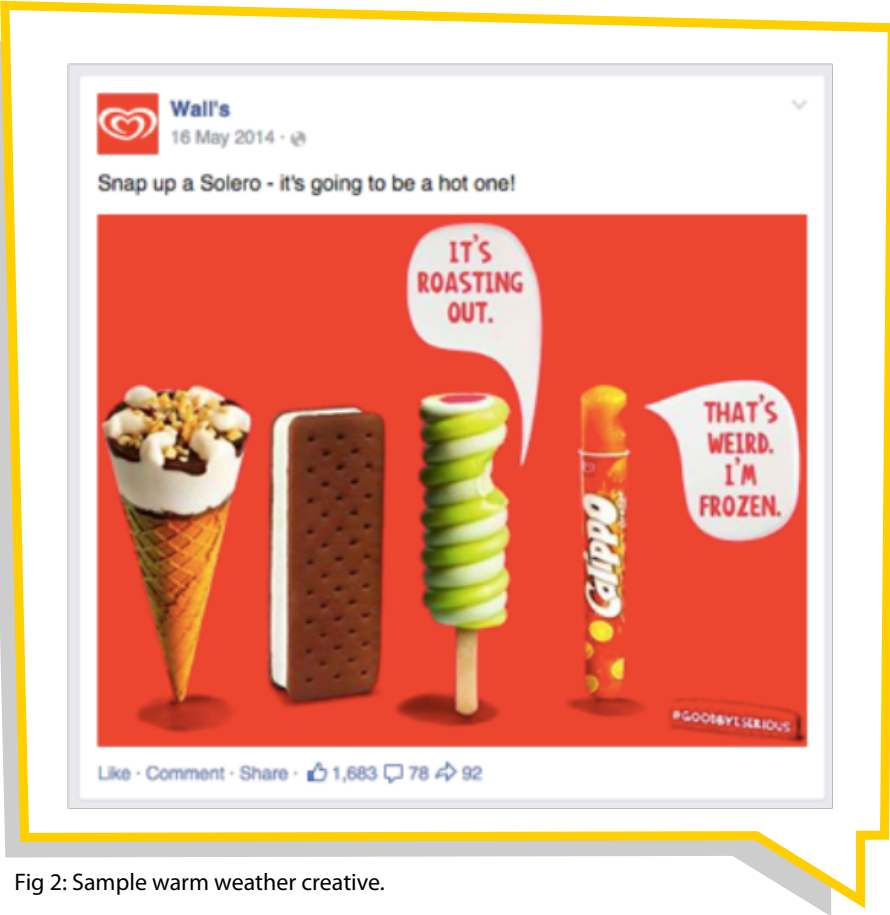
Fig 2: Sample warm weather creative.

We had material ready for cultural moments that allowed us to express our mischievousness.