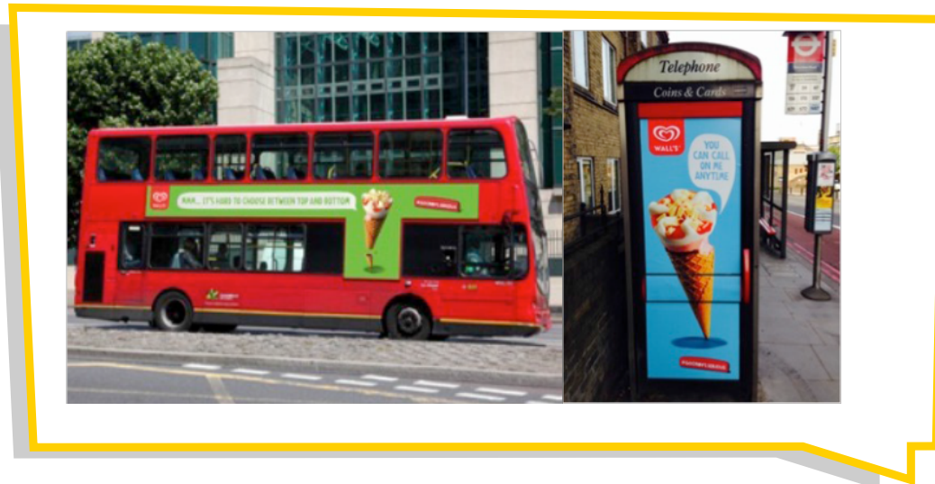
Fig 4: Outdoor executions of the 'Goodbye Serious' campaign.

Over the course of the campaign, we created over 60 different treatments, so the outdoor and Facebook ads were always contextual and always timely.