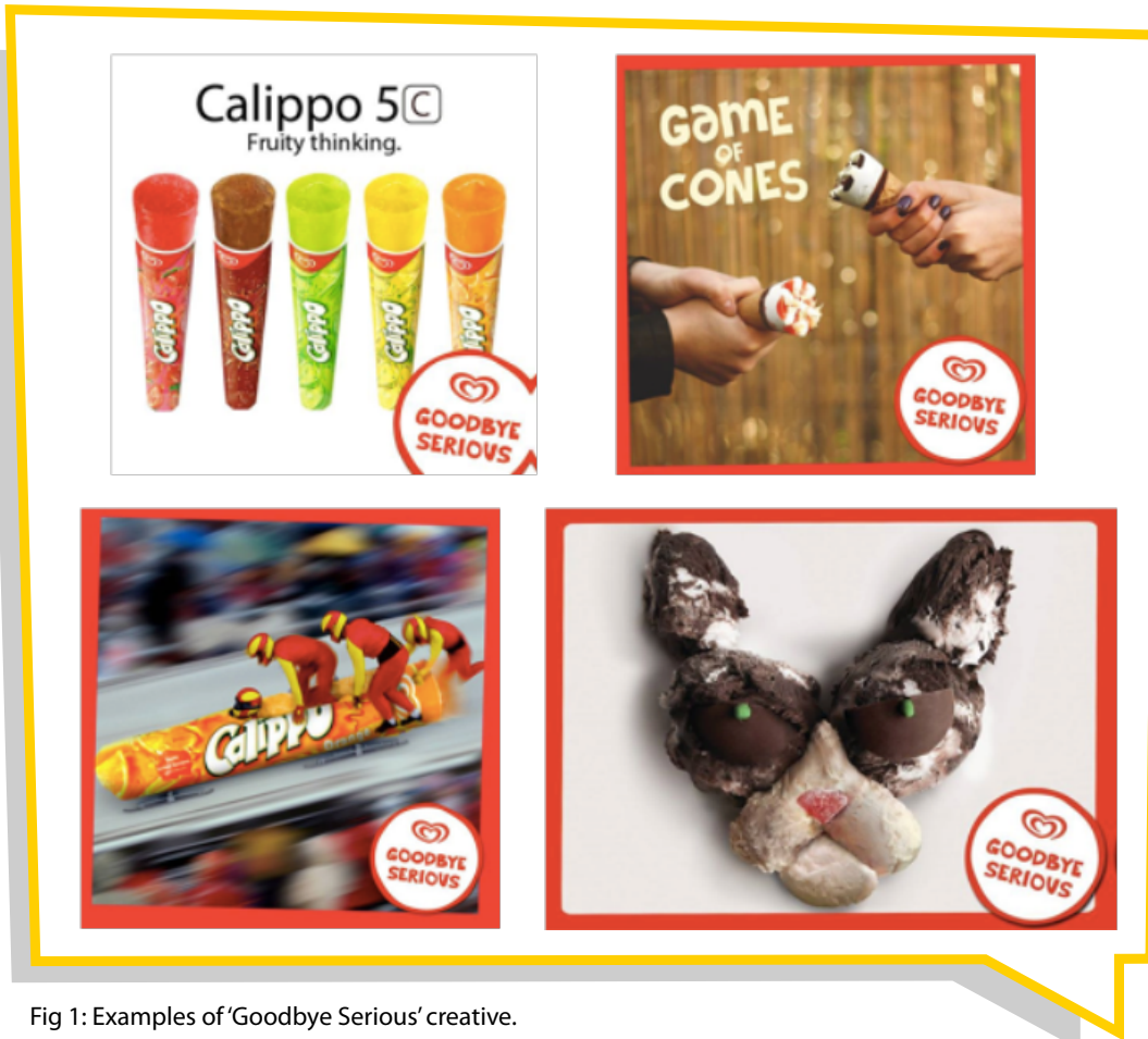
Fig 1: Examples of 'Goodbye Serious' creative.

As a result of the pilot findings, we knew for the UK and Ireland launch of the campaign in summer 2014, we had to deliver expressions of 'Goodbye Serious' that: