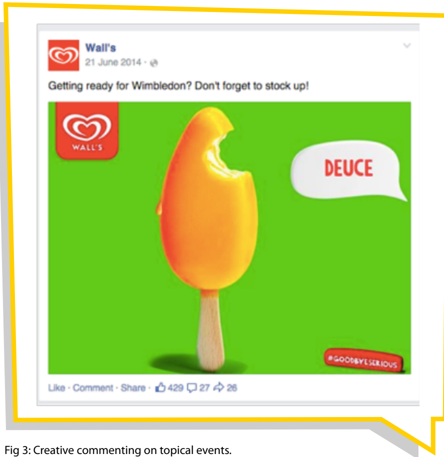
Fig 3: Creative commenting on topical events.