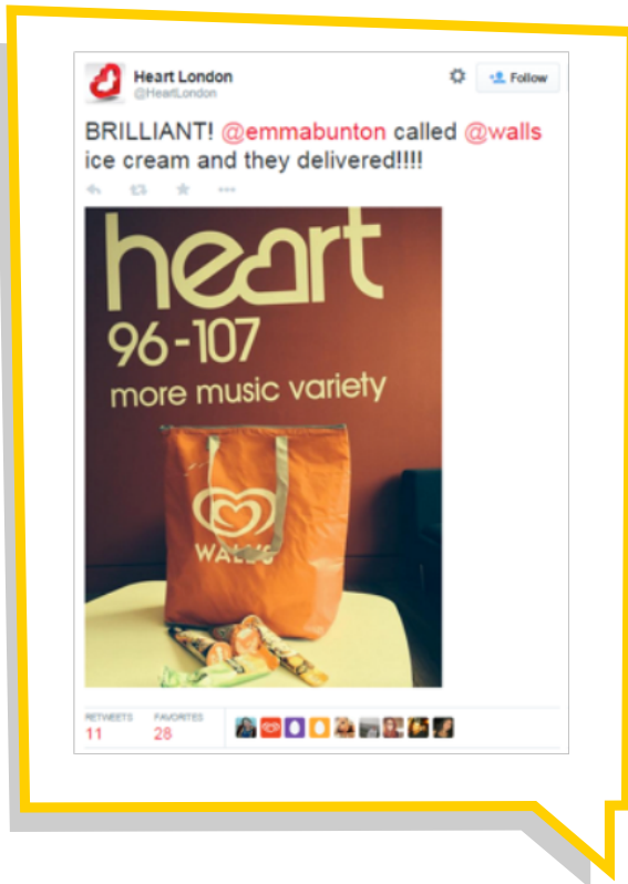
Fig 5: The campaign's Twitter activity including a celebrity element.

The campaign that we evolved on social gave us the best of both worlds – the chance to get involved in the conversation and cultural fabric of a British summer, whilst walking consumers through busy city streets into a store to buy an ice cream.